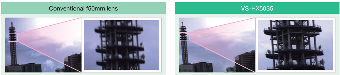
Peripheral resolution enhanced clarity compared to conventional models